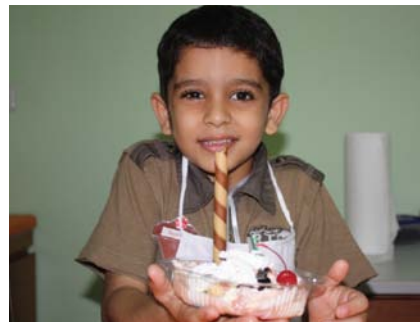
A student from Beacon Academy, Indonesia takes part in Ice Cream Day as part of the IPC Celebrations unit.