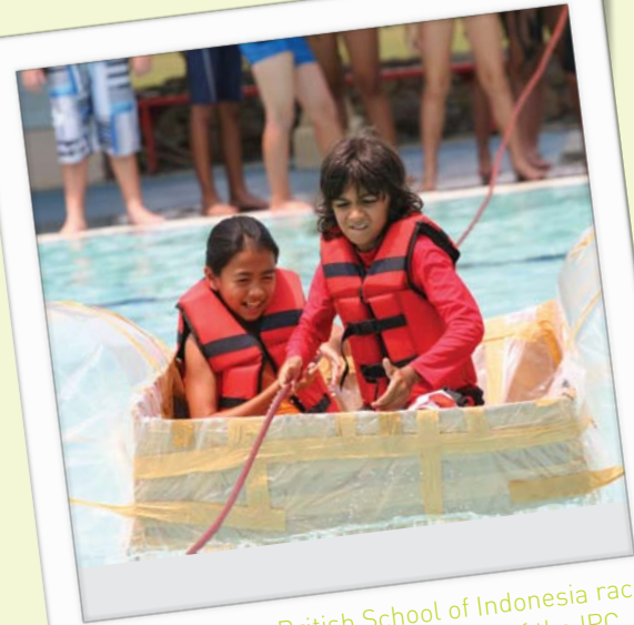
Students at the British School of Indonesia race rafts designed and built as part of the IPC unit Go With The Flow.